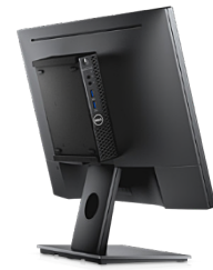
OPTIPLEX MICRO ALL-IN-ONE MOUNT FOR DELL E SERIES MONITORS

Small footprint mounting solution adapts to your environment, with cable management and monitor height adjustability, tilt, swivel and pivot functions.