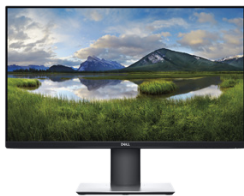
DELL 24 MONITOR - P2419H

23.8" ultrathin bezel optimized for dual display productivity. Easy Arrange feature enables multitasking efficiency and its small base frees valuable workspace.