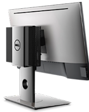
OPTIPLEX MICRO ALL-IN-ONE STAND

Small footprint mounting solution featuring integrated monitor power and Ethernet cables, as well as monitor adjustability with height, tilt, swivel and pivot functions.