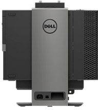
OPTIPLEX SMALL FORM FACTOR ALL-IN-ONE STAND

Small footprint mounting solution featuring integrated monitor power and Ethernet cables, as well as monitor adjustability with height, tilt, swivel and pivot functions.