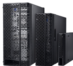
OPTIPLEX CABLE COVERS

Communicate clearly with a headset optimized to provide in-person sound quality, certified for Microsoft Skype for Business.