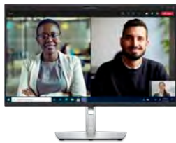
Dell 27 Monitor - P2723D

Create your ideal workspace with these recommended accessories.