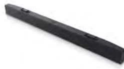
Dell Slim Soundbar - SB521A

Stay focused on a 27-inch QHD monitor optimized to deliver high performance details and clarity.